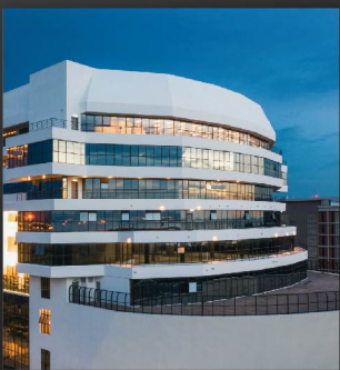
The Ship Campus

Welcome to the first edition of Making Waves, the newsletter of Peninsula College Georgetown. The Ship Campus is ready and waiting to welcome back both staff and students just as soon as the Ministry of Higher Education allows. Unfortunately, the global Covid pandemic has disrupted many aspects of life, including education. Students have had to adapt to learning online at home, academic staff have had to adapt to teaching via platforms that were new to them and administrative staff have had to carry out their tasks without the normal interactions which allows smooth running. Most of 2020, and 2021 so far, have been very stressful for all the Peninsula family. However, I am very impressed with, and very proud of, the way staff and students have approached this challenge. I very much look forward being in The Ship along with all our students and staff. In the meantime, take pride in the way you have dealt with this terrible situation and stay safe!